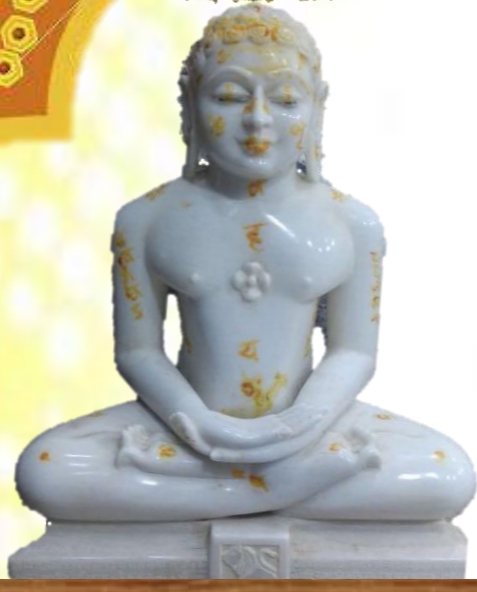
Shri Mahavir Swami Bhagwan