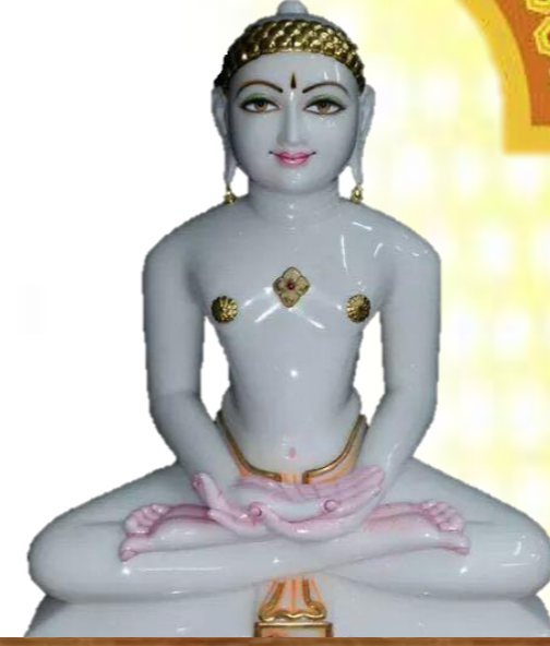
Shri Aadinath Bhagwan